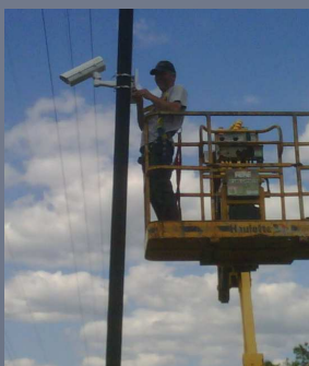
Above: At work 40 feet up!

In this recurring column we feature a different Northeastern employee each issue.