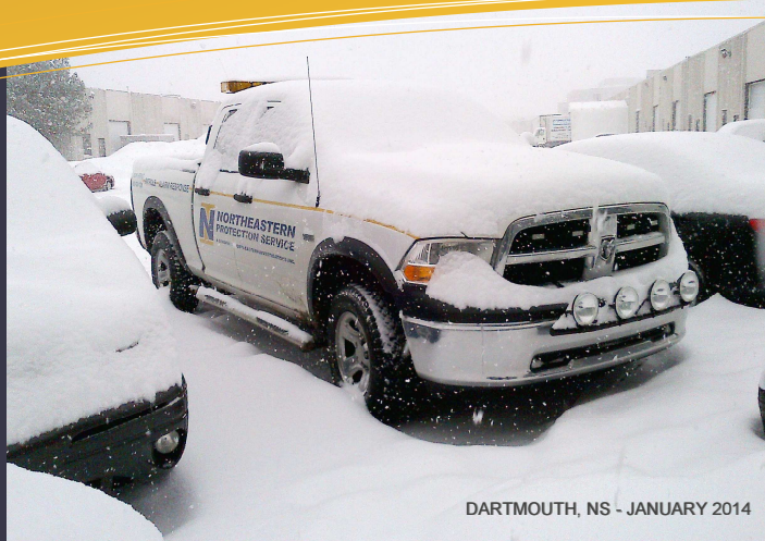
DARTMOUTH, NS - JANUARY 2014