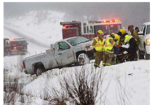
Emergency workers tend to an injured person after a pickup truck left the highway during a storm near Halifax, NS, January 2014.